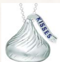
18" Hershey Kiss Diamond Accented Flat-Back Necklace $149