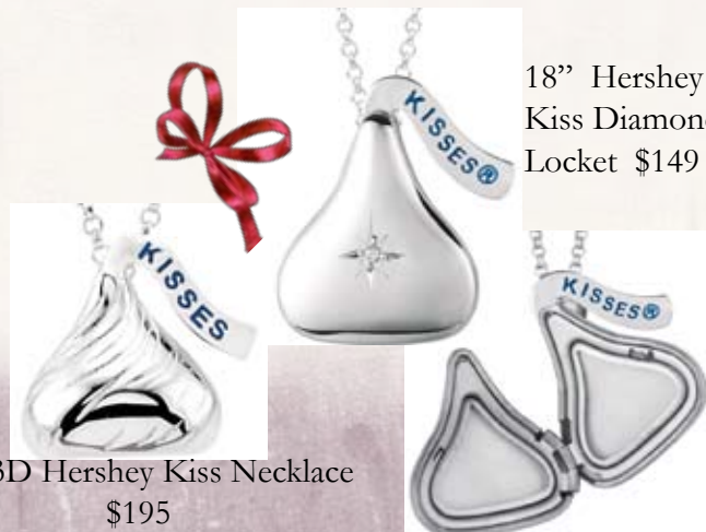
18" 3D Hershey Kiss Necklace $195