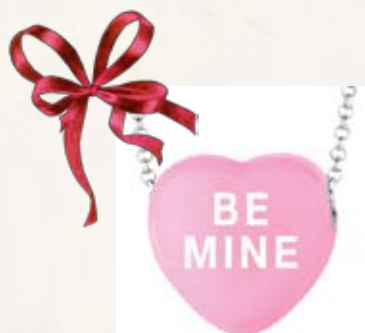
Sweethearts "Be Mine" Enamel Candy Heart sterling silver necklace $135