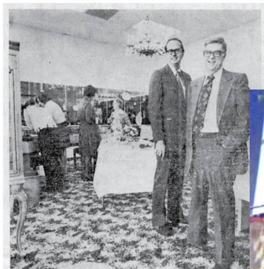
New WC store