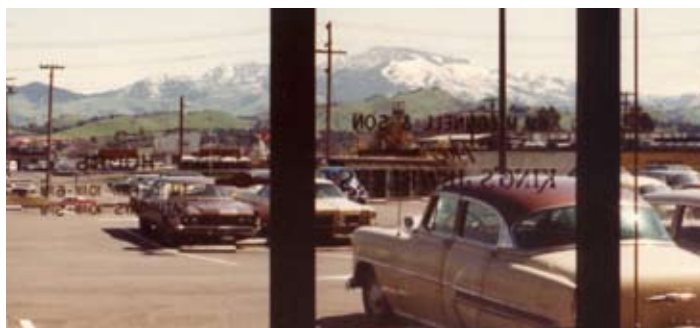
View from The King's Jewelers in 1975!

On January 14, 1975, McConnell & Son Jewelers opened their second location in the up-and-coming town of Walnut Creek, CA. Located at 1990 North California Blvd., the store was soon christened "The King's Jewelers", which was a proclamation of the family's faith – that Jesus Christ was their King and foundation for how