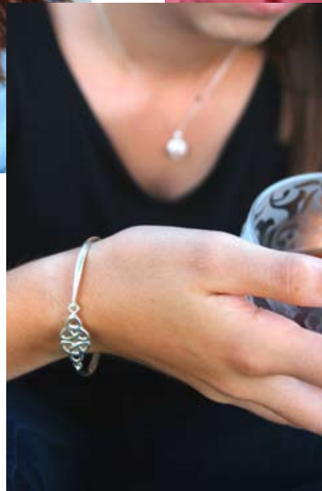
Celtic Knot Bangle $95

Trendy, graceful design combines with silver and rose gold to create updated jewelry simple enough for school or work, but fashionable enough for any party.