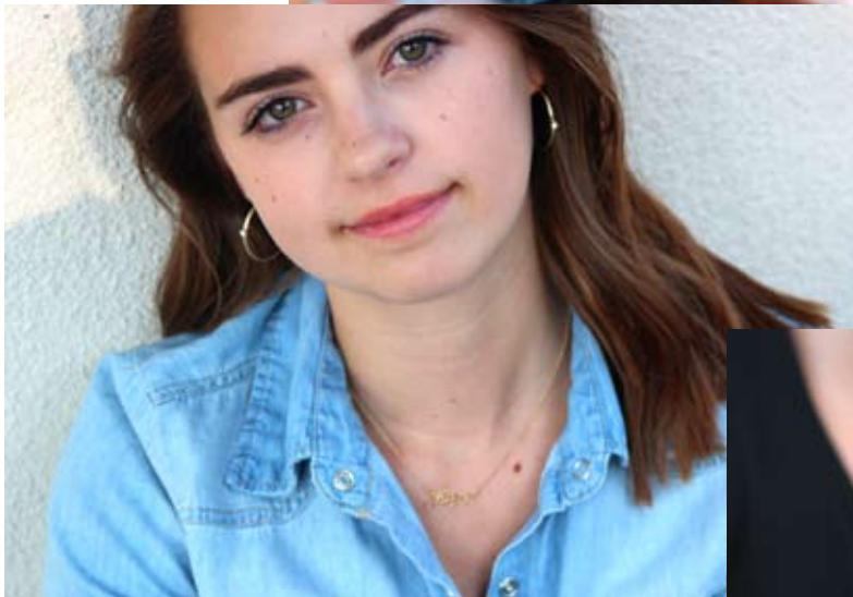
"Hope" Necklace $325 Hoop Earrings with Diamond $1295