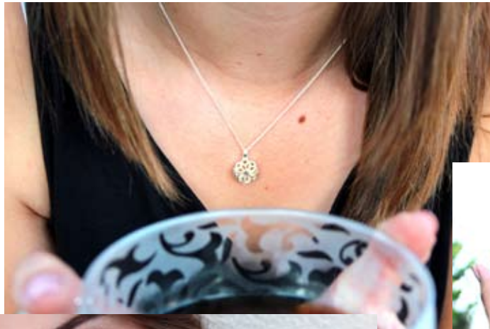
Open Flower Necklace $110.50