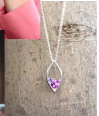
Amethyst & Iolite Necklace $120