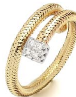
18K yellow gold diamond square charm single wrap ring. $795

Named for the romantic Italian landmark bridge, Ponte Vecchio jewelry conveys the splendor of the world at large and a creative spirit which is revealed in every precious detail.