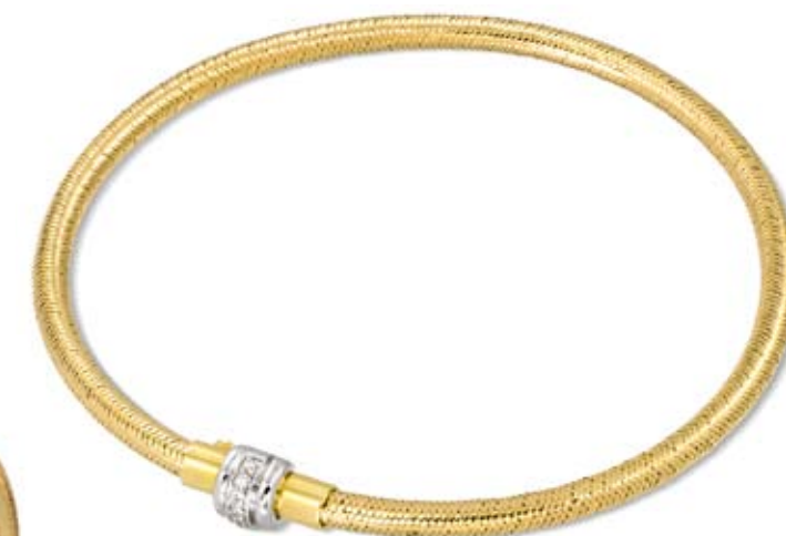
18K yellow gold diamond stretch bracelet. $1975

Lüente offers carefully-crafted designs reflecting a wide range of aesthetics. Whether you dress them up or dress them down, everything their passionate artists create is meant to make you stand out wherever your journeys take you.