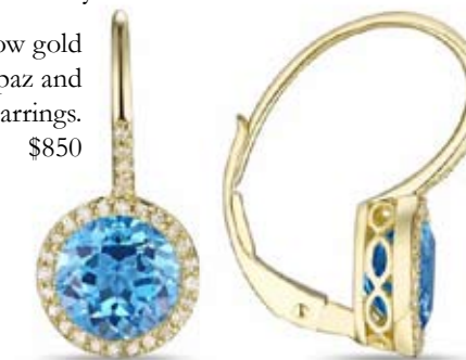
14K yellow gold blue topaz and diamond earrings. $850

Misani Italian leather bracelets do not go unnoticed: shape, material, color - every element is an explicit statement of independence and originality. Every piece of their collection expresses and magnifies the personality of the one who wears it.