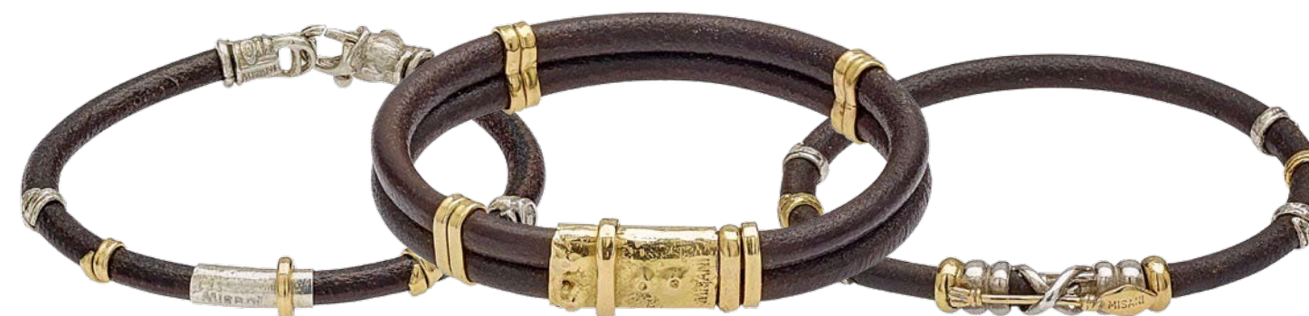
18K YG & sterling silver bracelet $695

Misani Italian leather bracelets do not go unnoticed: shape, material, color - every element is an explicit statement of independence and originality. Every piece of their collection expresses and magnifies the personality of the one who wears it.