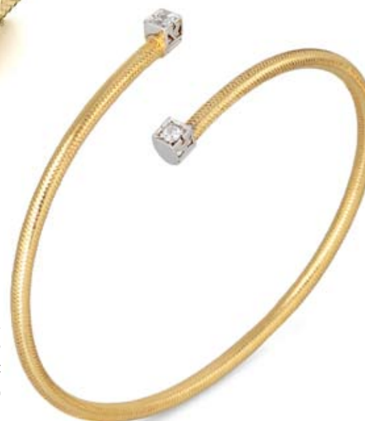
18K yellow gold diamond wrap bracelet $1650